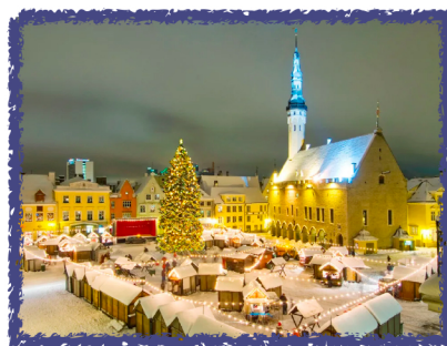
Christmas in Town Square - Old Tallinn, Estonia

One of the biggest emotional hindrances that impedes many people from fulfilling God's call on their lives is FEAR. Fear of failure, fear of the unknown, and fear of the "what if's." That is why the reassuring words of the Angel to Joseph (above) were also reassuring to us at the beginning and comforting to us today. We know this ministry was conceived in the hearts of men and women in 1993 by the Holy Spirit because of the manifestations of miracles and testimonies over the course of our history. It is true that; "what God predestines, He calls into being for His purposes."