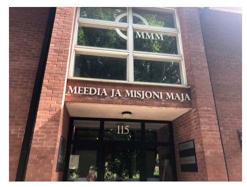
Mission House building in Tallinn at Tehnika street is home for Tallinn Pereraadio studio where many wonderful broadcasts are planned and recorded. Mission house also hosts Estonian Council of Churches.